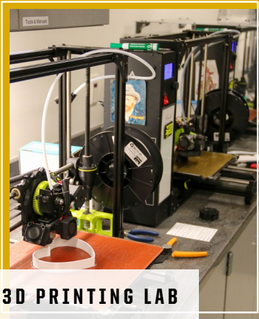
3D PRINTING LAB

Specialized space and technology for students to reserve for projects