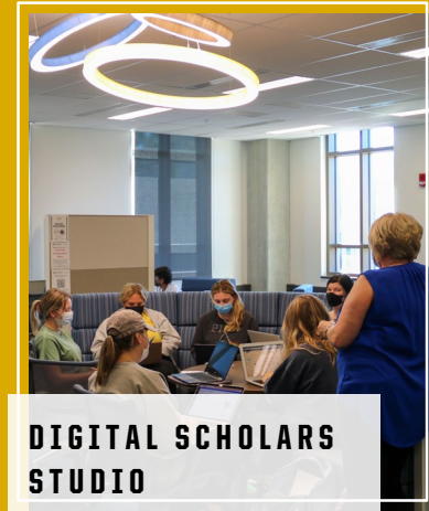
DIGITAL SCHOLARS STUDIO