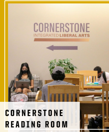
CORNERSTONE READING ROOM